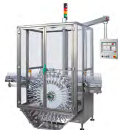
VIAL | Rotary Blowing Machines SW | for Cleaning Vials