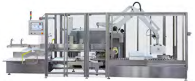
CASEPACKER | Fully Automatic Case-packing Machines with Track&Trace MC 820TT