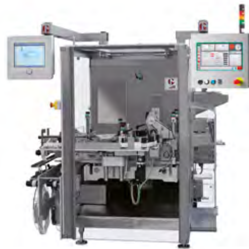
LABELLER BL-A | Linear Labelling Machines for cartons with Track&Trace