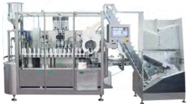
SOFT TUBE MILL

Filling/Capping Machines for Mascara Containers