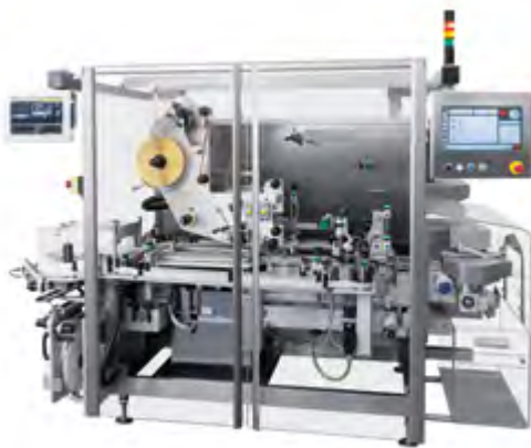
LABELLER BL-A420CW | Linear labelling Machines for cartons with Track&Trace and Check weigher