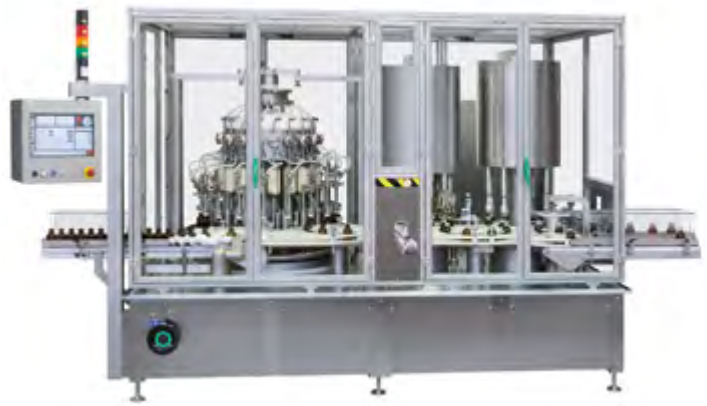
VIAL | High-speed Rotary Filling ML | and Capping Machine for Vials