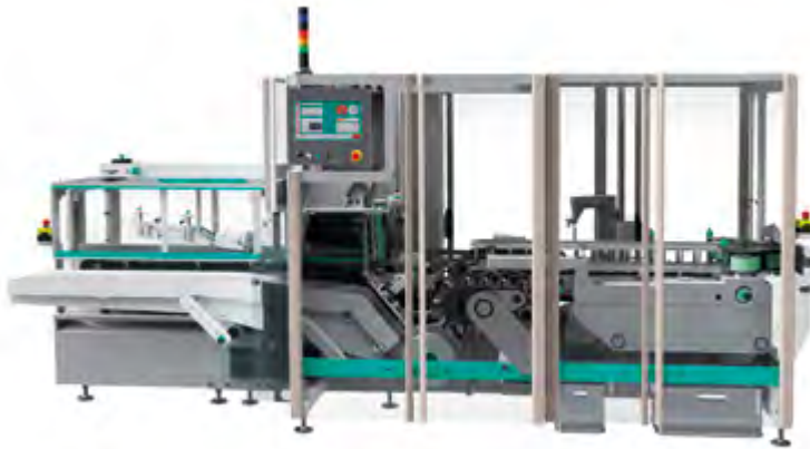
CARTONER MA 400

Continuous Motion Horizontal Cartoning Machines