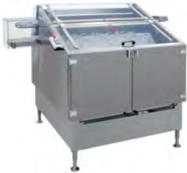
BULK FEEDING AVS

Elevator with Plates for Automatic Feeding for Syringes