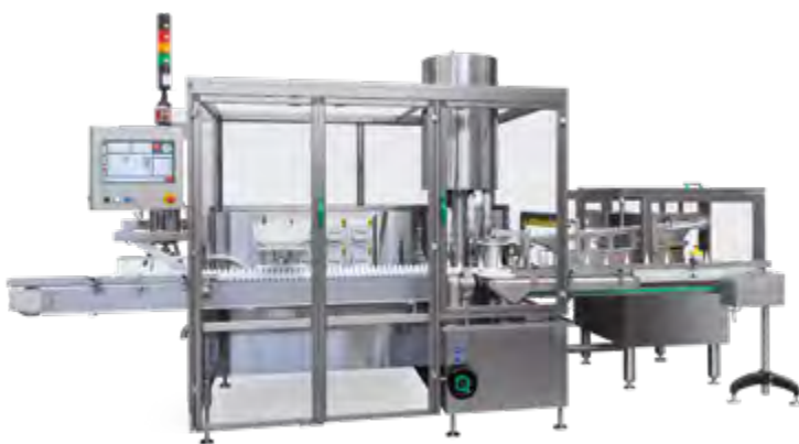
VIAL | Linear Continuous Motion ML | Filling/Capping Machine for Vials