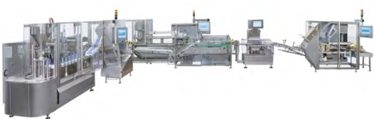
SOFT TUBE COMPLETE LINE

Filling/Closing Machines for PE or Metal Soft Tubes