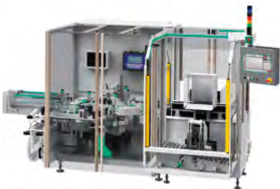
LABELLER/ CASEPACKER TRACKPACK

Labeller with Track&Trace Set-up and Semi-Automatic Case-packing Machines