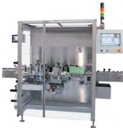
LABELLER BL-F | Linear Labelling Machines for Vials