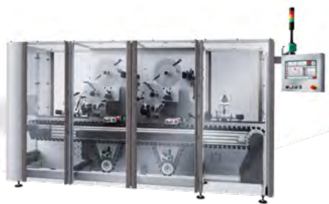
LABELLER BL-H235 | Horizontal high-speed self-adhesive labelling machine for containers