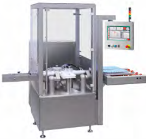
CODER CODY | Vial or Cap/Seal Coding and Verifying Machines