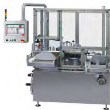
LABELLER RL-F | High-speed Rotary Labelling Machines for Ampoules/Vials