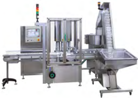
VIAL | Automatic Continuous Motion ML | Capping Machines