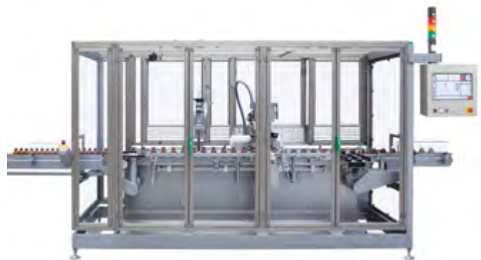
VIAL | Linear Intermittent Motion Filling/ ML | Capping Machines for Vials