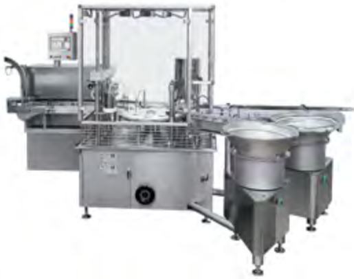
VIAL | Rotary Intermittent Motion ML | Filling/Capping Machines for Vials